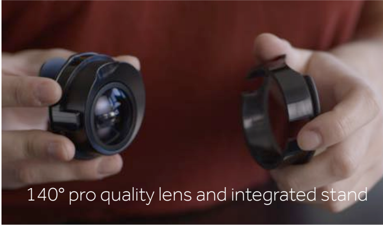
140° pro quality lens and integrated stand