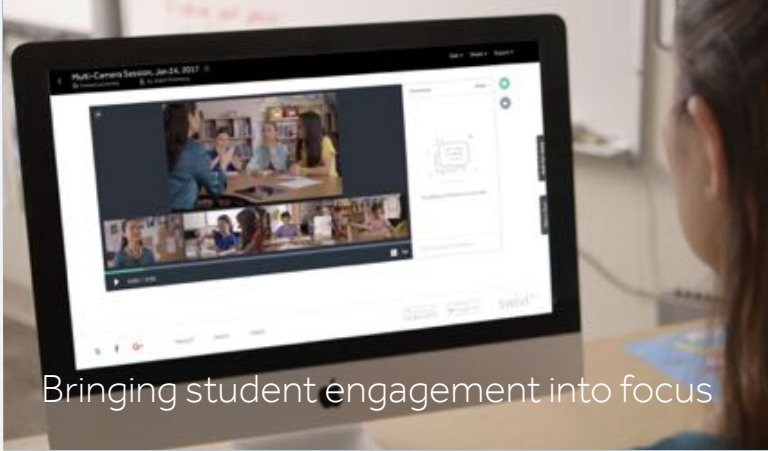
Bringing student engagement into focus